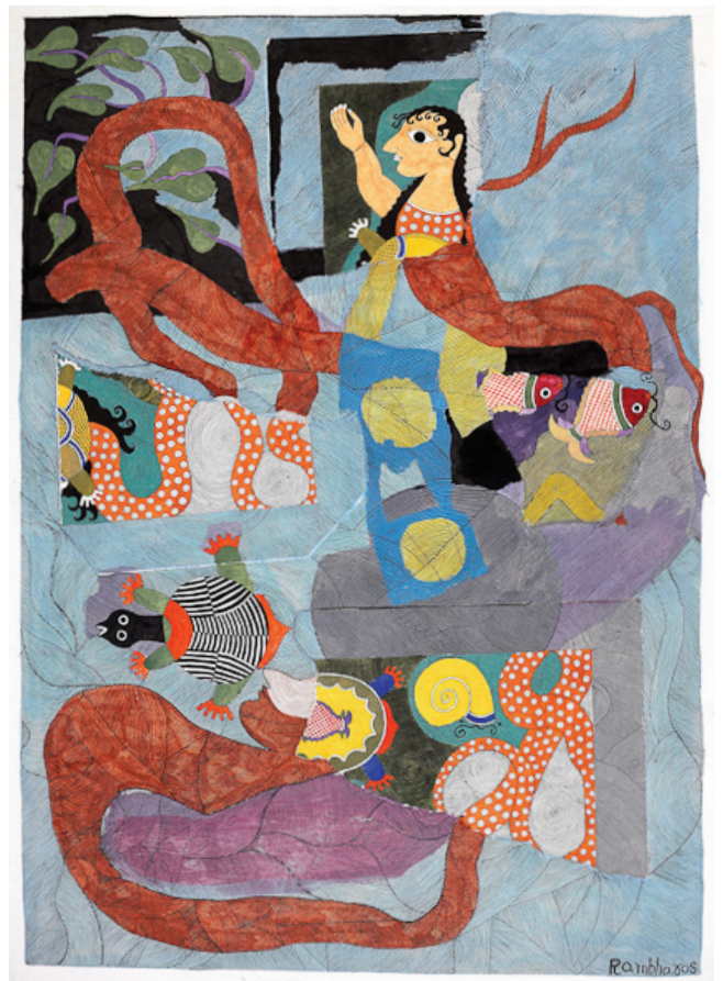
RAMBHAROS, Nagkanya - Underwater Snake Maiden , 2009

This exhibition has been organized by the Ethnic Arts Foundation to expand public recognition and appreciation of the painting tradition's beauty, powerful imagery, and capacity to depict classical deities, ancient rituals, and very contemporary national and global issues and events.